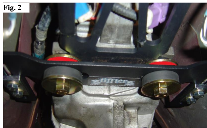
Example Install of TR-3650 with Stiffeners Loop

This crossmember is designed to cover many different applications and can be installed in four different directions depending on your application. Pay close attention to the installation picture! The crossmember can be installed either facing up or down. Rotate crossmember as needed to fit your transmission.