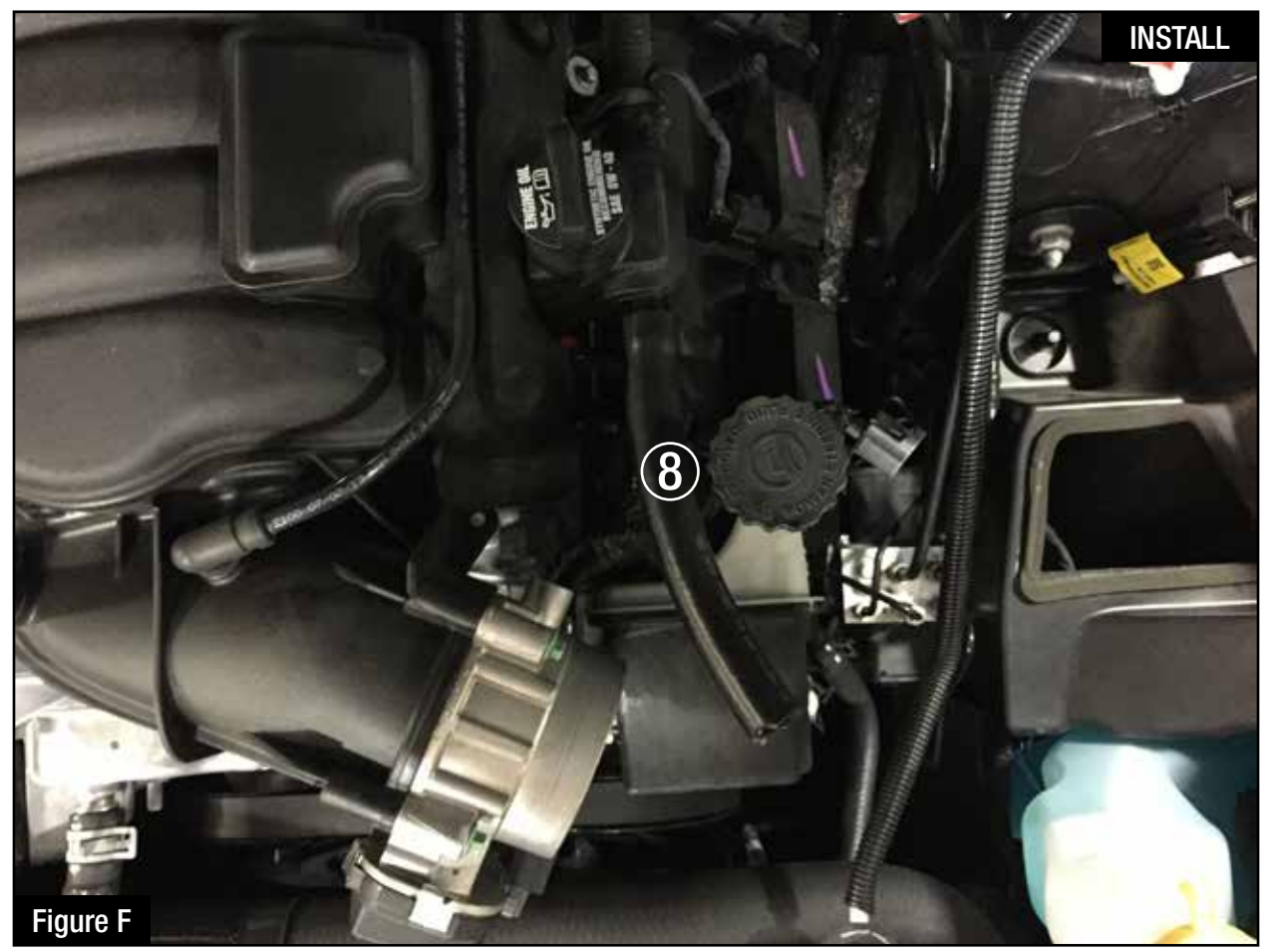
Refer to Figure F for Step 15

Step 15: Using the provided rubber hose, connect one end to the engine Crank Case Vent (CCV) fitting (8) as shown.