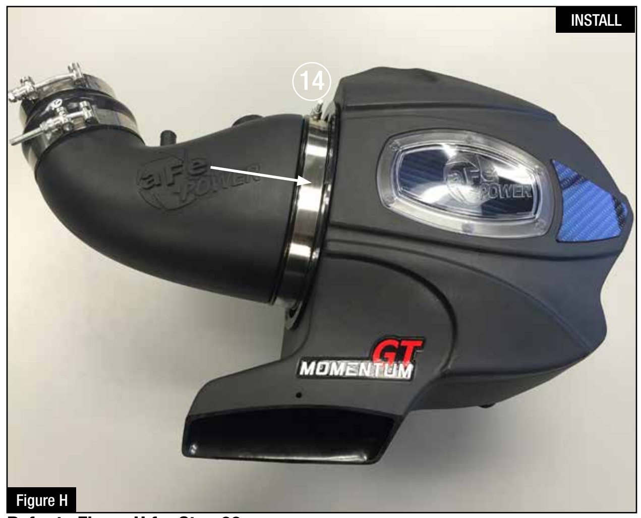
Refer to Figure H for Step 22