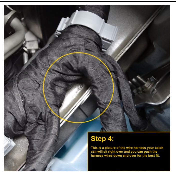
This is a picture of the wire harness your catch can will sit right over and you can push the harness wires down and over for the fit best fit.