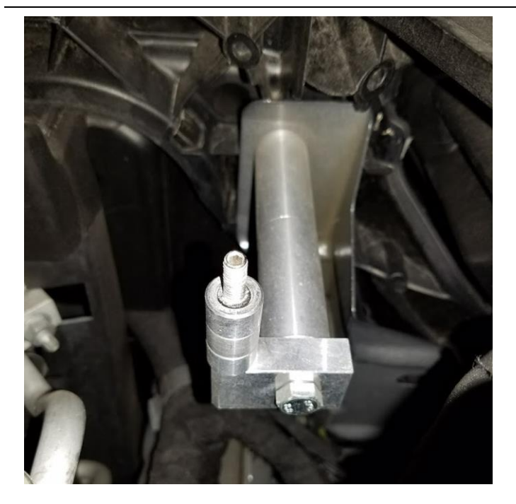
Use a socket and ratchet to snug your UPR fender mount bracket with the supplied spacers in place.