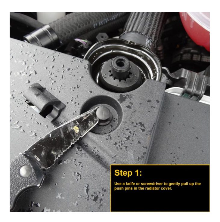
Use a knife or screwdriver to gently pull up push pins in the radiator cover

UPR Single Valve Catch Can UPR 5/8" Continental Braided Hose UPR Billet Hose Ends UPR OEM Factory Connectors UPR Adjustable Mounting Bracket UPR Plug & Play quick release fittings UPR Hi-Flo Billet Check Valve