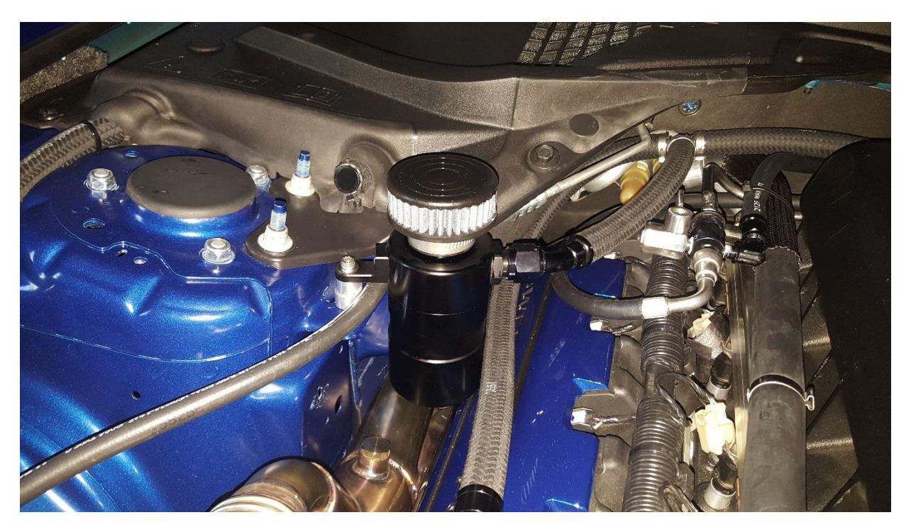
Be sure to shop our online store for the best deals: www.uprproducts.com

2. You are going to attach the 5/8 braided hose with the built in T to the can. The shorter line will connect to that side of the valve cover that is closest to the can.