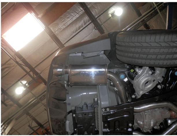
Step 4. Finish the initial installation by fitting the Muffler Assemblies onto the Mid pipe Assemblies using the supplied 3.00" clamps and inserting the hangers into the rubber insulators.