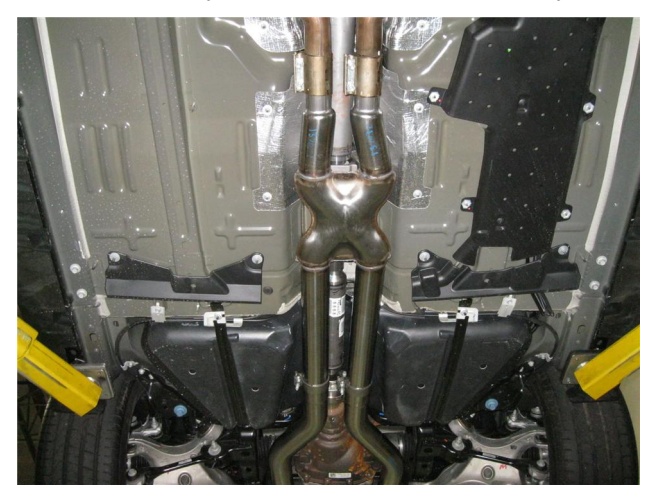
Step 2. Begin installation of the new system by loosely attaching the X-Pipe Assembly to the outlets using the OEM clamps. Leave all clamps loose until final adjustment.