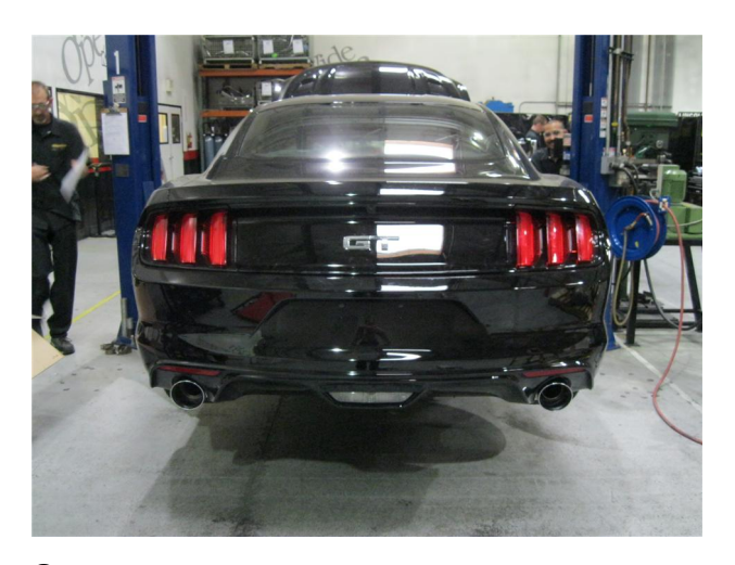
Step 5. Once a final position has been chosen for the new exhaust system, evenly tighten all clamps from front to rear using the torque specifications on page one of the instructions. Inspect all fasteners after 25-50 miles of operation and re-tighten if necessary.