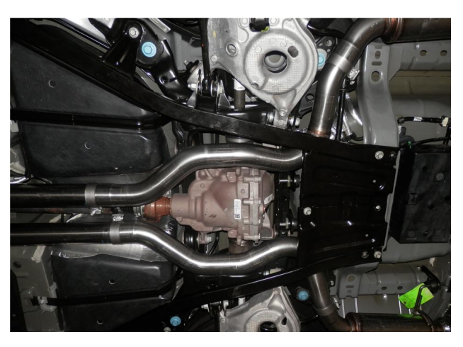
Step 3. Next attach the Mid Pipe Assemblies to the X-Pipe using the supplied 3.00" clamps and fitting the hangers into the rubber insulators.