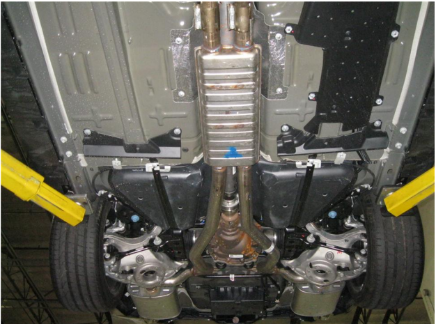
Step 1. Begin removing the OEM exhaust system by loosening the clamps located in front of the resonator. Next working front to rear extract the hangers from the rubber insulators and remove the OEM system. Retain insulators and clamps as they will be used to install the new system.