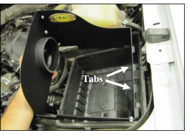
11. Install the Airaid intake assembly onto the factory airbox bottom. Insert the Panel tabs into the slots first, then lower the tube side down and fasten the three clips.