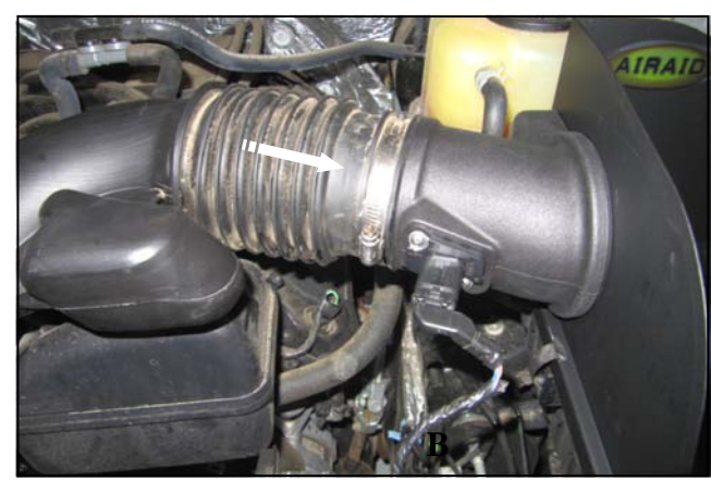
12. Slide the factory intake tube onto the Airaid Tube and tighten the clamp. Reconnect the Mass Air Flow or MAP sensor