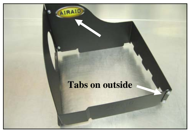
5. Assemble the Front and Rear Panels as shown with the tabs on the outside of the assembly. Use the four 6-32 Phillips Head Screws, #6 Flat Washers, and #6 Kep Nuts to secure the assembly. Apply the Airaid Decal on the completed Panel assembly as shown.