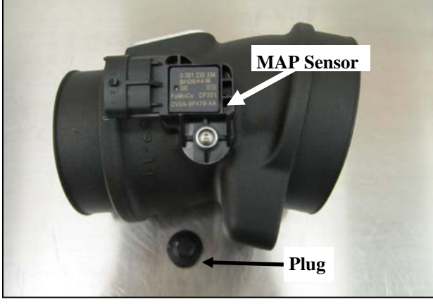
8. Transfer the MAP Sensor into the Airaid intake tube as shown. Secure the sensor using the Long 8-32 Button Head Screw and the Washer . Discard the Plug. It will not be used.