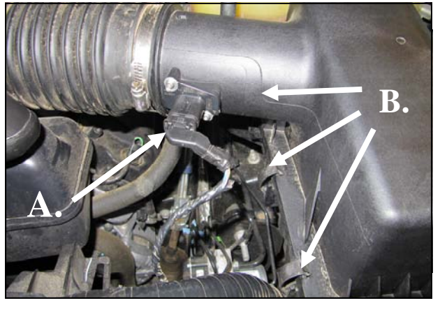
2. A. Disconnect the sensor, MAF or MAP, in the factory airbox top.

1. Loosen the hose clamp on the airbox side of the factory air intake tube.