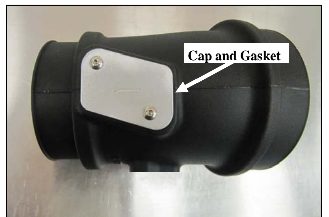
7. If your vehicles intake utilizes a MAP sensor : Install the Meter Cap and Gasket onto the Airaid Intake tube as shown, using the two 8-32 1/2" Button Head Screws.