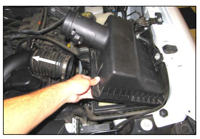
3. Slide the factory intake away from the airbox. Lift up and slide the airbox tabs out of the slots in the lower half and set aside.

B. Unfasten the Three clips on the left side of the air -box.