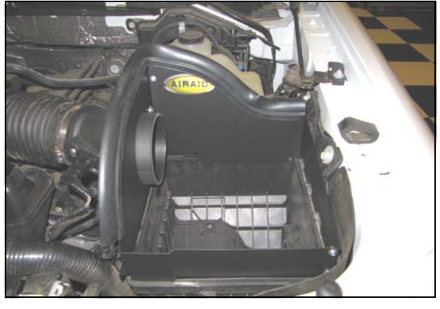
13. Install the Weather Strip to the Panel assembly as shown, with the contour rolling away from the filter area.