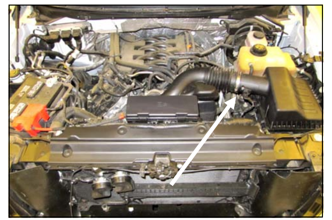
Disconnect The Negative Battery Terminal!

1. Loosen the hose clamp on the airbox side of the factory air intake tube.