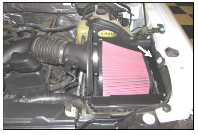
14. Install the Airaid Premium Filter on to the Air Meter Tube and tighten the clamp.