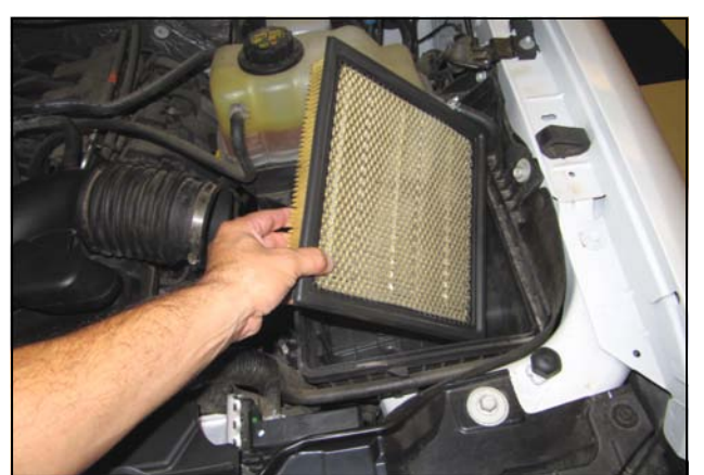
4. Remove the Factory air filter.